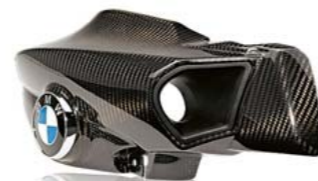
HP CARBON AIR INTAKE