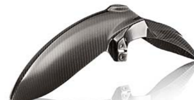
HP CARBON FRONT MUDGUARD