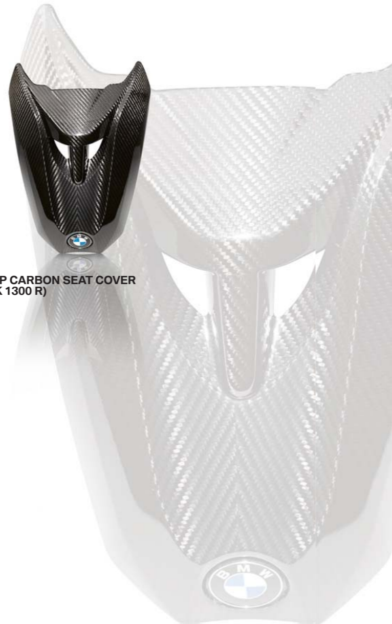
HP CARBON SEAT COVER (K 1300 R)