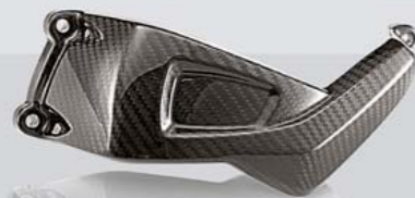
HP CARBON CLUTCH COVER TRIM