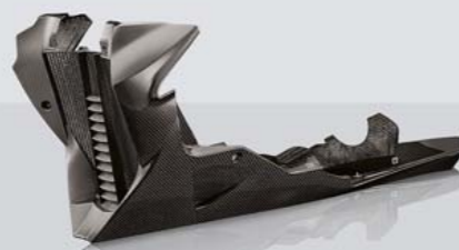
HP CARBON ENGINE SPOILER