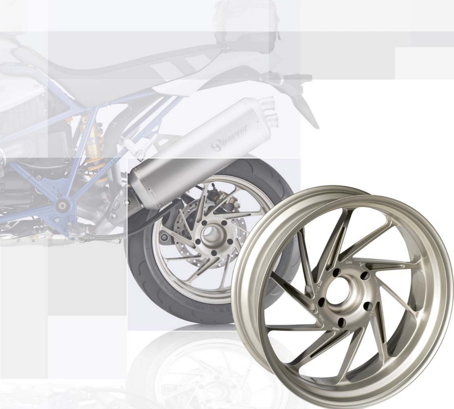
HP FORGED WHEELS