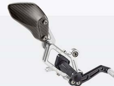
HP RIDER FOOT PEGS