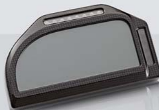
HP INSTRUMENT CLUSTER