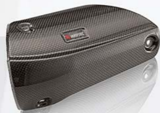
HP CARBON HEAT PROTECTOR FOR STANDARD SILENCER