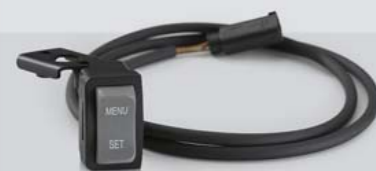
ADDITIONAL CONTROLS FOR HP INSTRUMENT CLUSTER