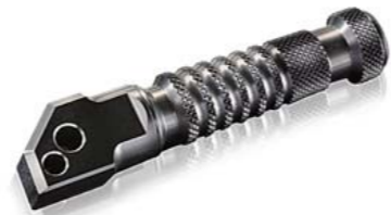
HP PILLION PASSENGER FOOT PEGS