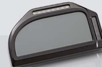
HP INSTRUMENT CLUSTER