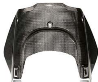
HP CARBON SILENCER COVER