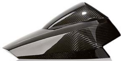
HP CARBON SEAT COVER (K 1300 S)