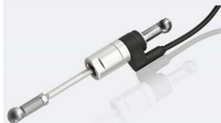
HP GEAR-SHIFT ASSIST