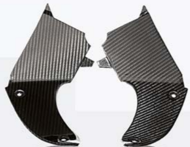
HP CARBON COCKPIT INTERIOR PANELS