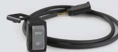
ADDITIONAL CONTROLS FOR HP INSTRUMENT CLUSTER