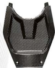
HP CARBON AIRBOX COVER