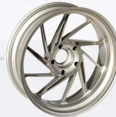
HP FORGED WHEELS