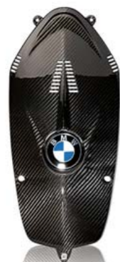
HP CARBON ENGINE COVER