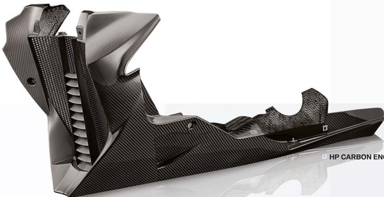
HP CARBON ENGINE SPOILER