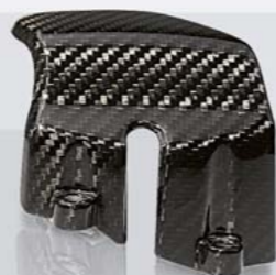
HP CARBON CLUTCH TRIM