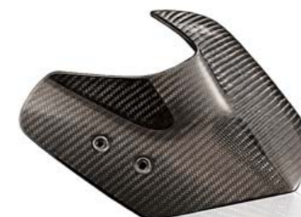
HP CARBON WINDSHIELD