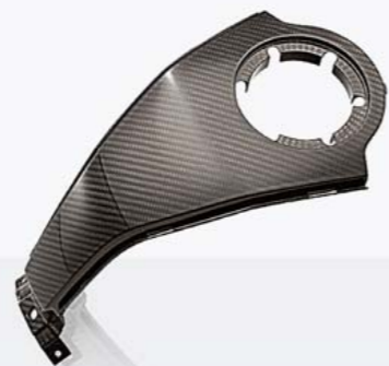
HP CARBON TANK COVER