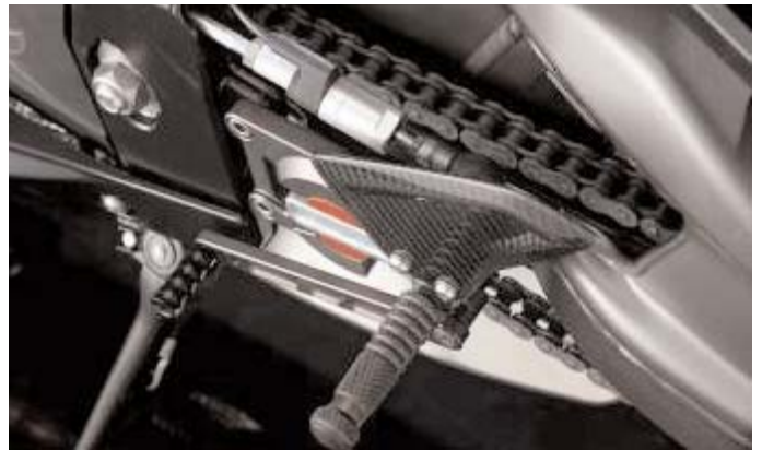
HP shift assistant