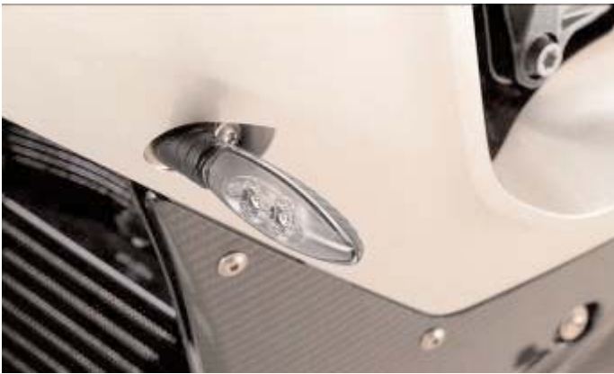
LED turn signals