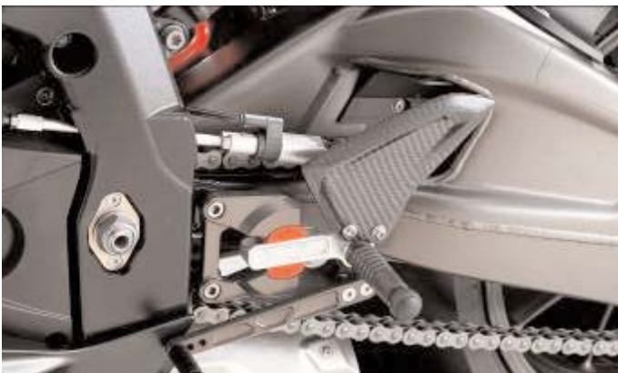
HP Footrest system