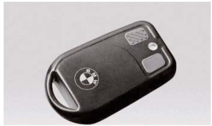
Anti-theft alarm system