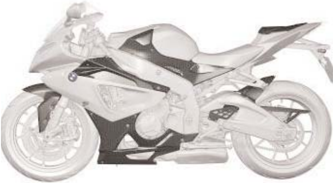
HP Carbon Mounted parts