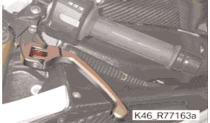
HP brake lever / HP clutch lever, hinged